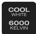
6000K & Cool White

The NIGHT BREAKER LED family - OSRAM's first street-legal1) LED retrofit lamps.