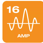
Connects to any 16A (3 phase) charging unit or station with a type 2 connection.

Charge at home and on the move Type 2 to Type 2 PIN | 3PHASE