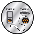
Type 2 to Type 2

Charge at home and on the move Type 2 to Type 2 PIN | 3PHASE