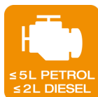
≤ 5 L. PETROL ≤ 2 L. DIESEL

New Boost function allows user to restart vehicles with depleted batteries